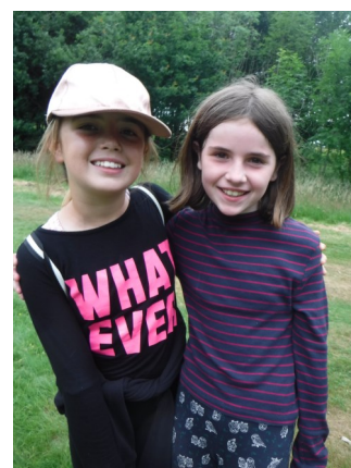
16 control points in 30 minutes.