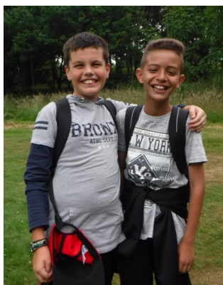
19 control points in 30 minutes

I have attached one of the Essex Stragglers Junior Mini Series to the email if you would like to try to get involved over the summer holidays!