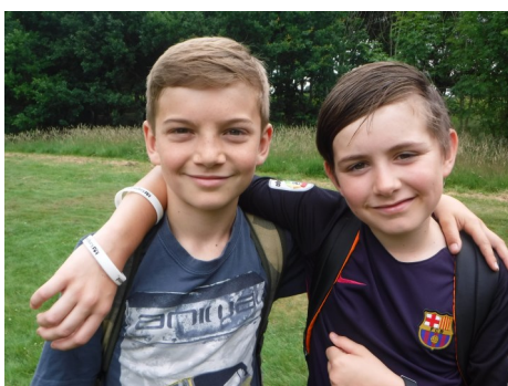
23 control points in 30 minutes