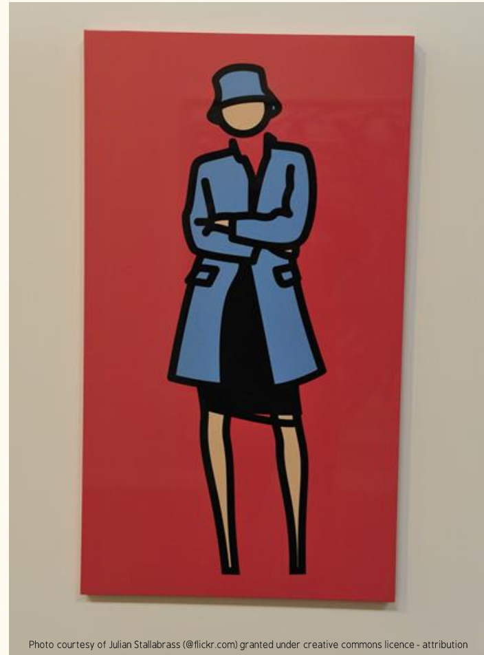
Photo courtesy of Julian Stallabrass (@flickr.com) granted under creative commons licence - attribution

Draw yourself or a friend in the style of Julian Opie's artwork.