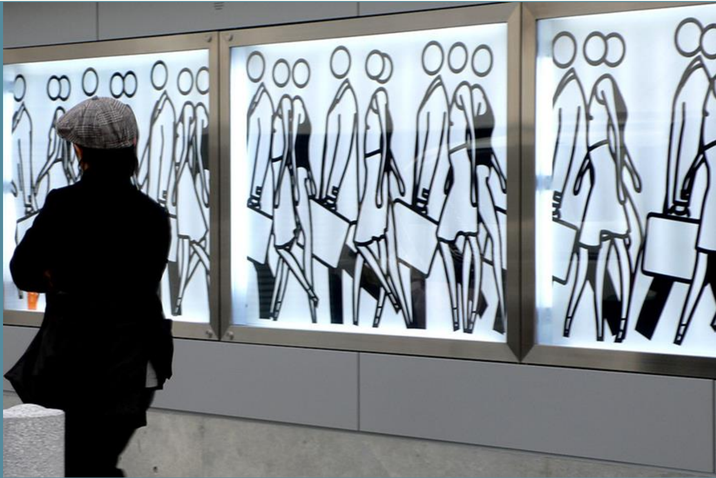
Photo courtesy of Shinichi Sugiyama @flickr.com) granted under creative commons licence - attribution