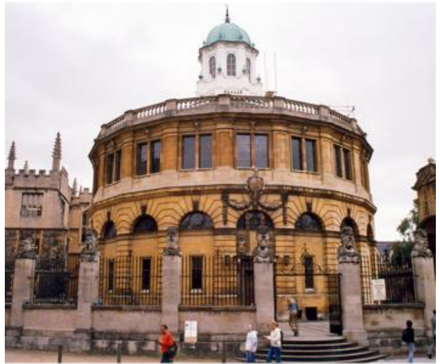
Sheldonian Theatre, Oxford