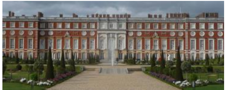
South Façade, Hampton Court