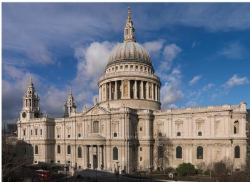
St Paul's Cathedral, London

The following buildings were all designed by Sir Christopher Wren: