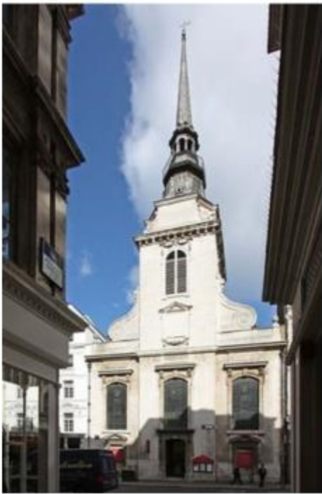
Church of St. Martin, Ludgate, London