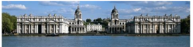
Royal Naval College, Greenwich