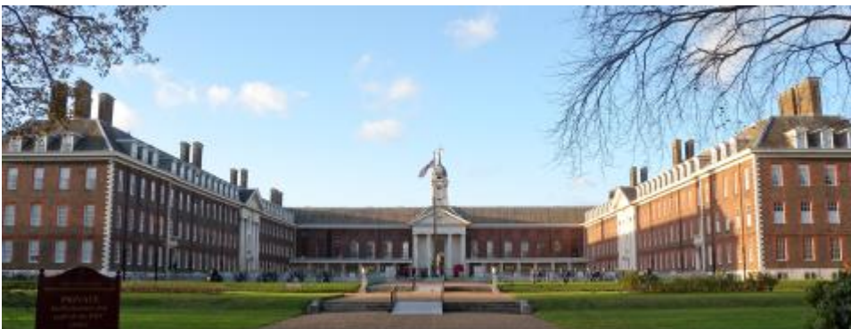
Royal Hospital, Chelsea, London