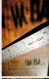
Illustration: https://www.shutterstock.com/image-vector/illustration-wooden-ruler | https://www.shutterstock.com/image-vector/illustration-plastic-ruler | https://www.shutterstock.com/image-vector/illustration-metal-ruler