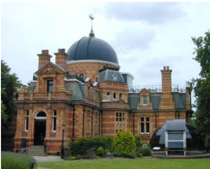
Royal Observatory, Greenwich